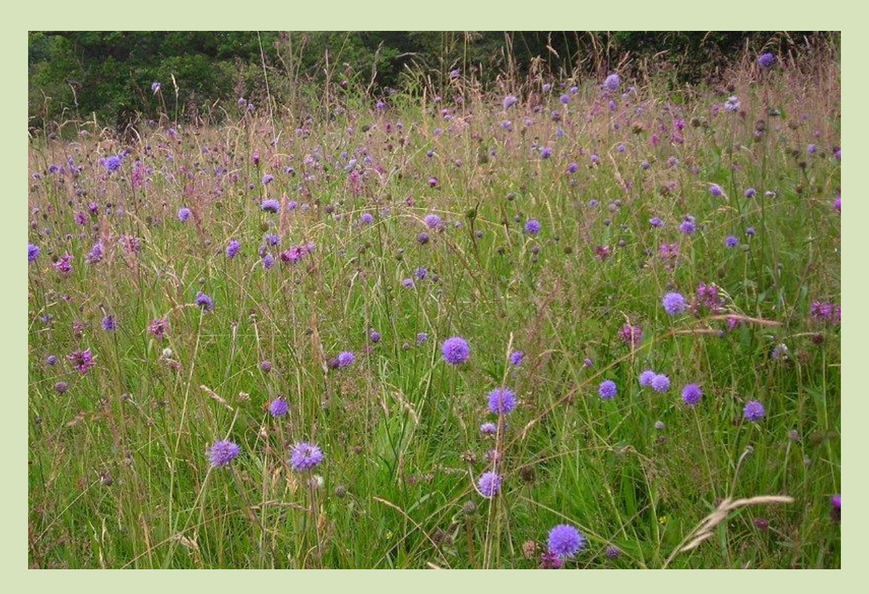
In the damper areas it was a real treat to see ragged robin doing well (below left). There was also a profusion of common knapweed aka hardheads, including some with an unusually pale centre to the flowerheads (below right).