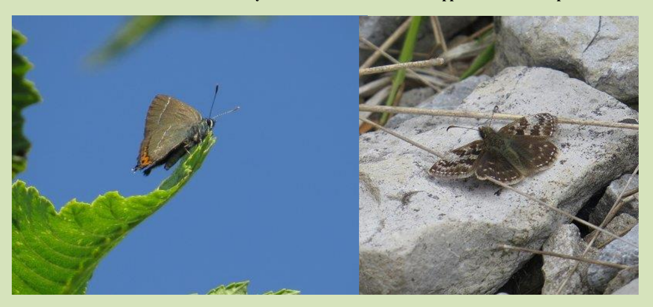
White letter hairstreak butterfly on elm