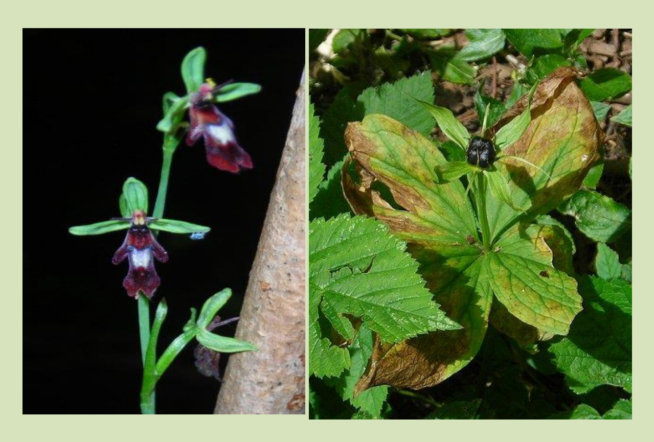
Bee Orchid (left) and Herb Paris with berries

In keeping with the 1964 list I only recorded a few species of particular interest. The Herb Paris was in fruit, so we could see the shiny black berries which was interesting as we usually see this plant earlier in the season with its extraordinary 4-way flowers. I was sorry not to find the butterfly orchid (although at this date I would expect it to be over and therefore hard to spot!), pyramidal orchid or the chickweed wintergreen. We only found a single plant of cow wheat – this seems to be scarce throughout Ryedale and declining, although we do not know why.