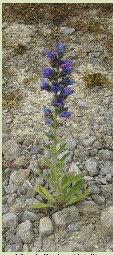
Viper's Bugloss (detail)