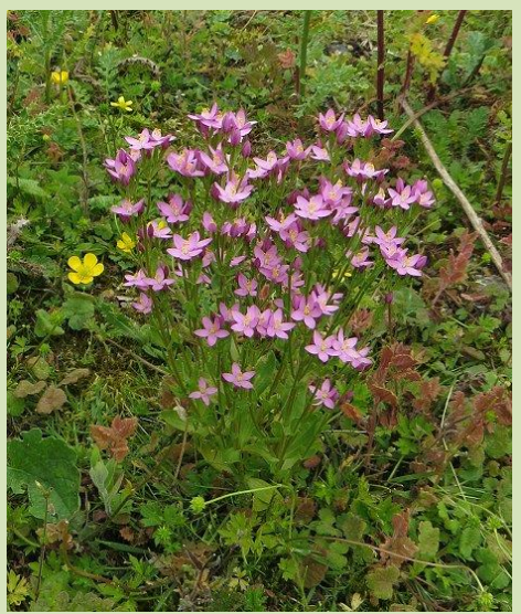
Common centaury (typical form)