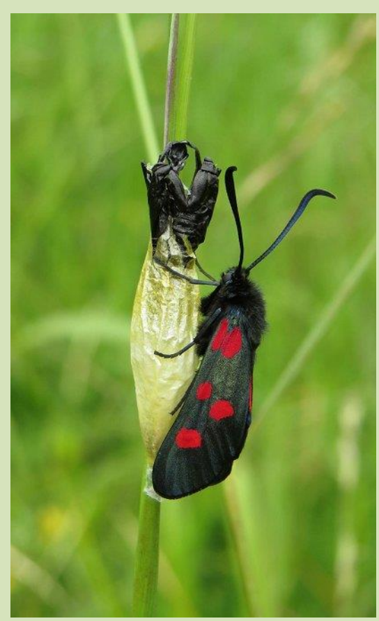
Narrow-bordered five spot burnet moth just on the wing