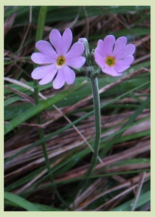
The delightful bird's-eye primrose, a rarity in Ryedale

After the "botanical ramble" Nick Fraser kindly invited participants to a fantastic spread of tea, biscuits and cake, continuing our celebratory theme.