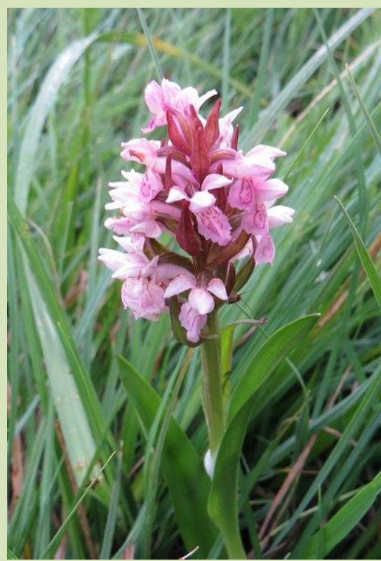
Another, characteristic, colour form of the Early marsh orchid