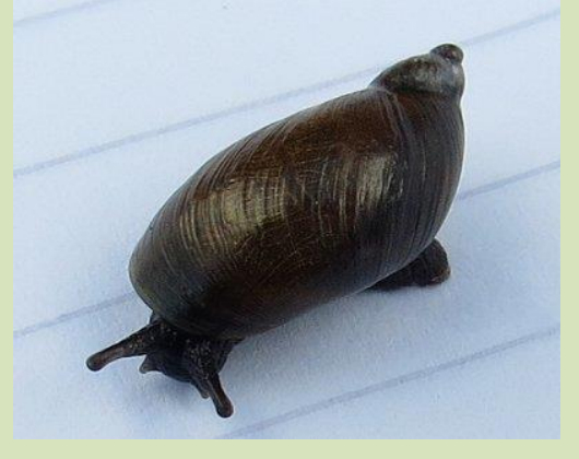
One of several small dark snails found on damp vegetation