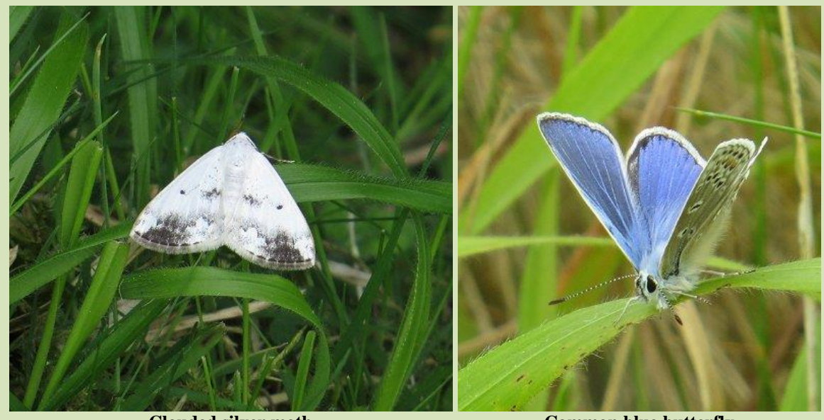
Clouded silver moth