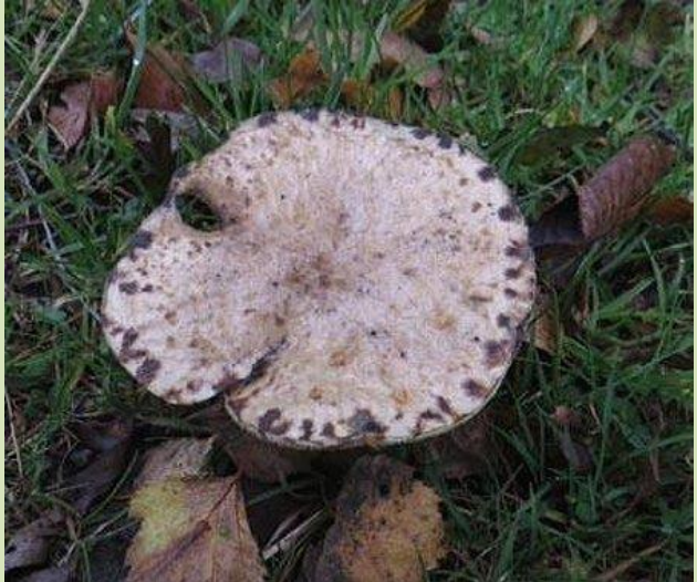
Suillus grevillei (left) and S. viscidus (right)