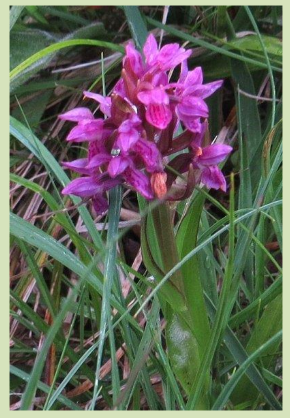
One of several colour forms of the Early marsh orchid