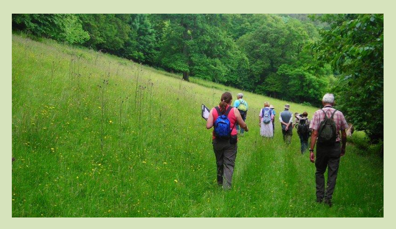
In the waterside meadows we saw several butterflies and moths, including a ringlet butterfly and a magnificent green caterpillar (subsequently identified as a Copper Underwing moth ( Amphipyra pyramidea ).