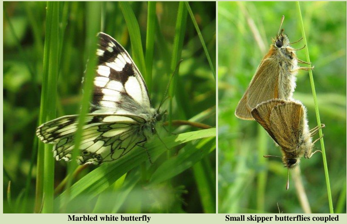
Marbled white butterfly