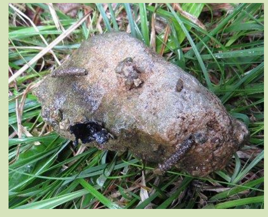
Strange moth which looked mummified, probably casued by fungus

This year 10 members & guests met on a somewhat overcast evening for a botanical ramble in an ideal place (marred by midges) under guidance of Mr. Jim Pewtress. Flowers & plants found included [the list below]. As well as the plants we saw and photographed what appeared to be a mummified moth (perhaps covered with fungus) and several small black snails on the damp vegetation. We didn't see or hear woodcocks, but there was a heron.