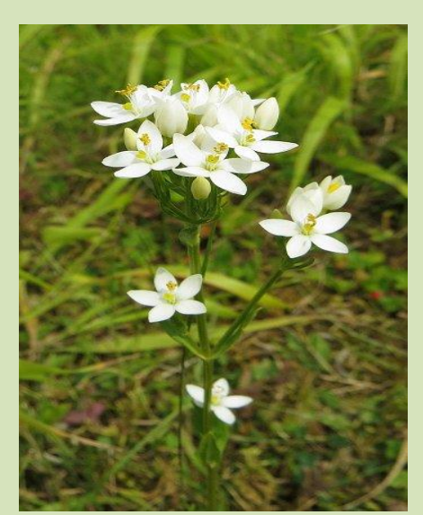
Common centaury (white form)