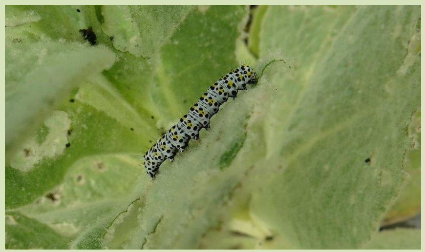
Mullein moth caterpillar